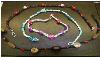
2011 Teen End of Summer Party Beaded Bracelets and Necklaces for Teen Giveaways.